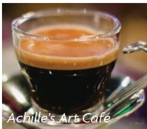
Achille's Art Café