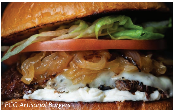
PCG Artisanal Burgers